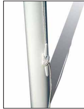
Bitt with an external rope