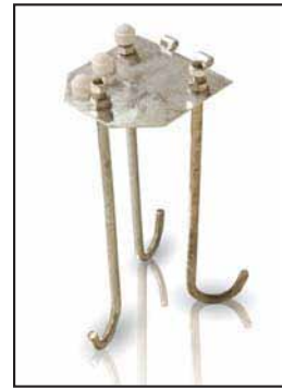
Hinge base attachment